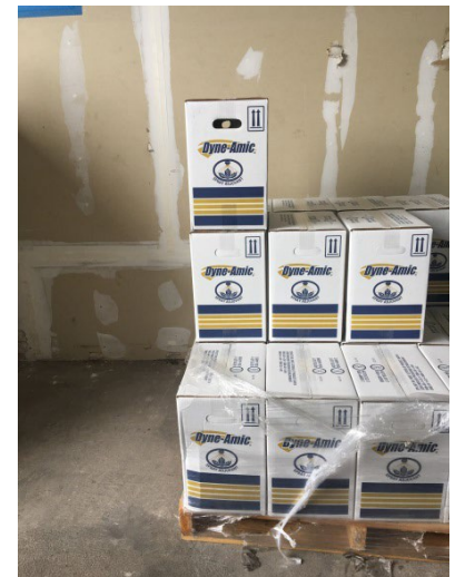
Cases stored from 6" to 52"