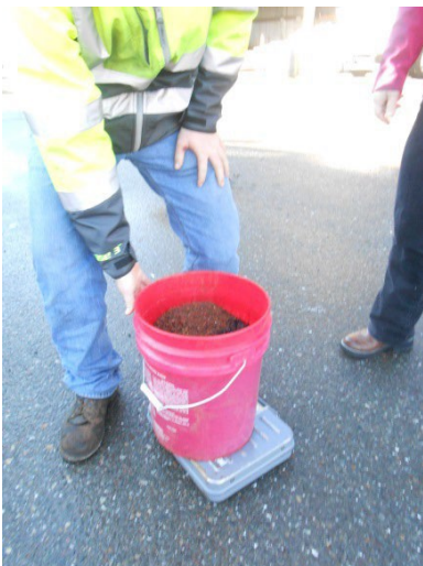
Cold Mix Bucket- 50 lbs.