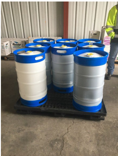
Full Herbicide- 15 gal. = 125.1 lbs. Lowered from 6 in. surface to ground