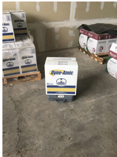
Case of Herbicide- 40 lbs. Case Handle at 13 inches