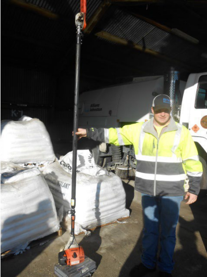
Pole Saw – 17 lbs. Shortest at 107” Extends to max of 180” (15’)