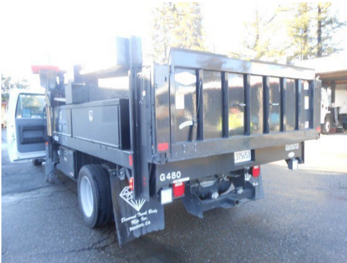
Work Truck with Lift, step to enter Driver's side 16 inches