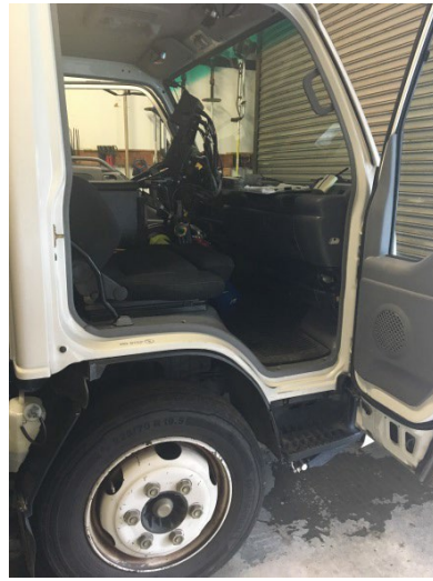
Passenger side of Spray/Tank Truck