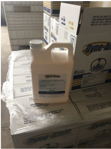
Single container of Herbicide= 18lbs. Moved from 6" pallet to 55" Utility Storage on Pick-up truck