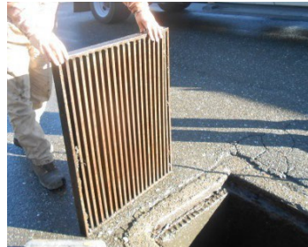
Grate Inlet - Avg.= 100 lbs.