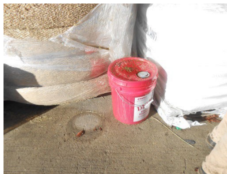
Pavement Finisher Bucket- 40 lbs.