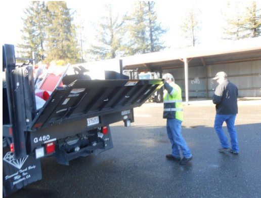
Work Truck with Lift