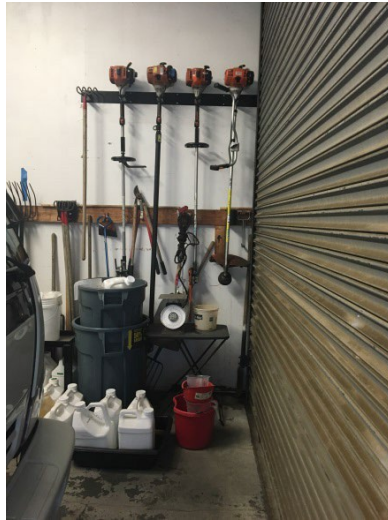
Pole Saw- weighing up to 13 lbs. Weed Whacker- 17 lbs.