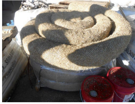
Straw Wattle - 35 lbs.