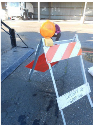
Traffic Barricade with sign- 17 lbs.