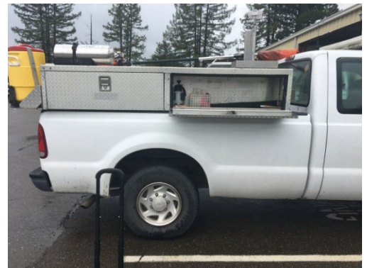
Utility Bed on Pick-up Bottom of Storage at 55" from ground- Storage for Herbicide or chainsaws