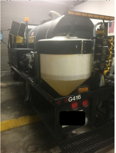
Tank of Herbicide- Top of tank At 64" from floor; 46" from step