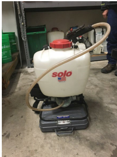
4 Gallon Spray Back Pack- (Typically filled with ONLY 3 Gallons) Empty- 10 lbs.; Plus 3 Gal. - 35 lbs. ; Plus 4 Gal. – 43 lbs.