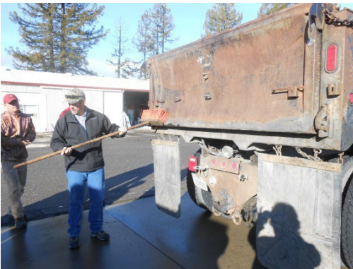
Bobtail Dump Truck- 39 inches to Bed of truck/gate