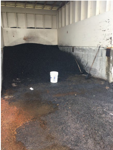
Cold Mix Asphalt Repair Material Shovel and 5 Gallon Bucket for Pot hole repair