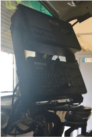
Controls for Spray/Tank Truck- Typically controlled by passenger