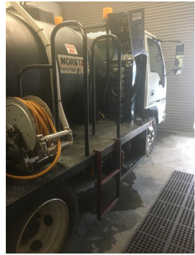
Side of Spray/Tank Truck- Portable Ladder Steps at 12" – 24" – 36" to bed of truck