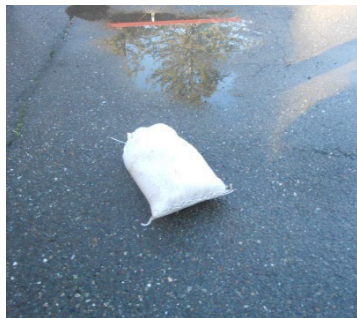
Sandbag- 28 lbs.