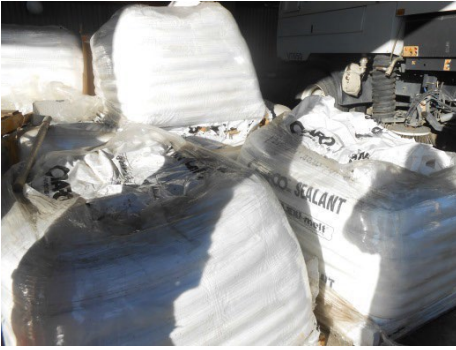
Crack Sealant- 25 lbs. per bag 50 bags per pallet