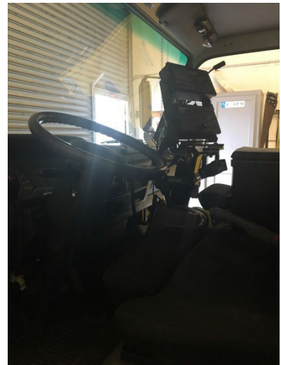
Driver's Side of Spray/Tank Truck