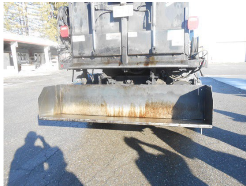
Bobtail Asphalt Patch Truck – 19 inches to lowered gate.