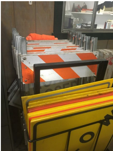
Barricades- 15 lbs.