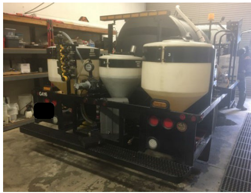
Spray/Tank Truck Step Height- 18 inches from ground