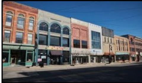
Small Business / Nonprofit Facilities