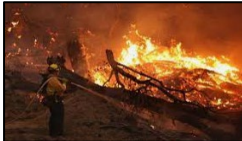
Wildfire Prevention / Other Climate Change Response