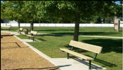
Parks / Open Space / Recreation