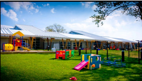
Childcare Facilities & Libraries