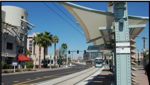
Roadway / Parking / Transit